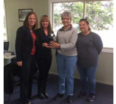
Feral Cat Award